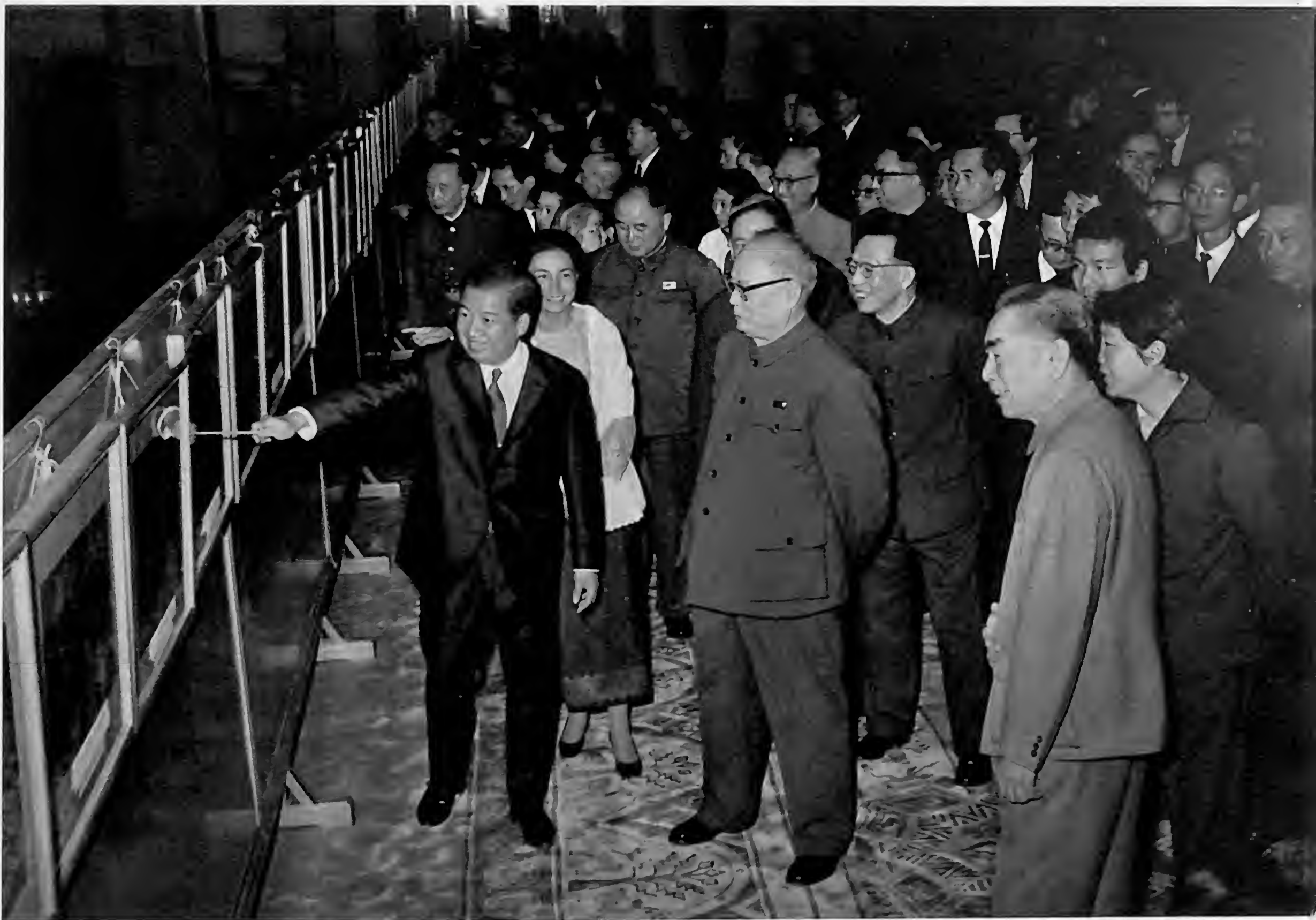
Samdech Sihanouk showing Premier Chou and other Chinese leaders the photographs on display.

as its chairman, the patriotic Cambodian armed forces and people, fighting dauntlessly in common hatred against the enemy, have wiped out large numbers of enemy effectives and liberated more than 90 per cent of the territory and more than 80 per cent of the population. The traitorous Lon Nol clique is encircled ring upon ring by the people's armed forces and the broad masses of the people. Bottled up in the isolated city of Phnom Penh, the traitorous Lon Nol clique is in a state of constant panic. Its days are numbered, no matter what methods U.S. imperialism may use to bolster it. It can be said with certainty that Samdech Sihanouk's trip to the Liberated Zone will further push forward the victorious development of the situation in Cambodia and hasten the total collapse of the traitorous Lon Nol clique.